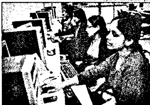
UPGRADING FACILITIES: CDE, Ratan Tata Library in for a major revamp

grading our infrastructure and improving academic performance. The sum allocated is not very huge in comparison to grants given to other educational institutions, but we have to take into consideration the fact that the number of students at the institute is far less than those studying in the IITs or IIMs."