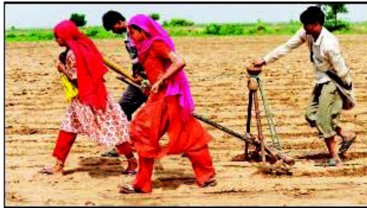
PLOUGHING IN MORE

of National Mission for Protein Supplements and National Mission for Sustainable Agriculture. The government plans to promote organic farming and combining modern technology with traditional farming to maximize crop yields and sustain productivity.